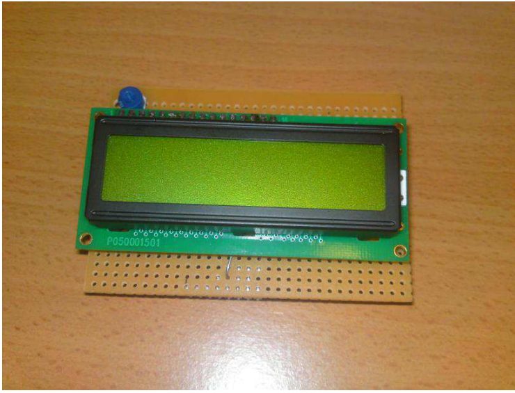
Figure 1.2 – Topway LMB162ABC LCD Module

This application example uses the Topway LMB162ABC 16 character 2 line LCD display. The display is driven by a 5V power supply and 4 data lines control the characters displayed on the display. For more information on Topway displays see: http://www.topwaydisplay.com/Pub/Manual/LMB162ABC-Manual-Rev0.2.pdf