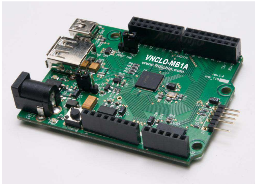
Figure 1.1 - VINCO

Note: Any sample code provided in this note is for illustration purposes and is not guaranteed or supported.