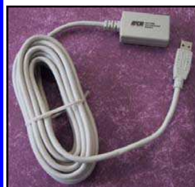
USB Line Extender