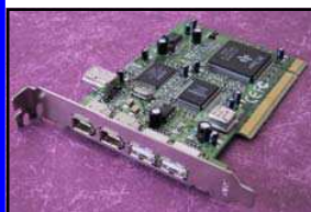
USB & FireWire Combo Host Card (PCI)

Our new range of USB 2.0 and IEEE 1394a (Firewire 400) products, allow users to have both USB 2.0 and IEEE 1394a connection types on one PCI Card and 5.25 / 3.5 Bay depending on model. Running at 480 Mbps the USB connection is slightly faster than the Firewire connection, but both have there different uses.