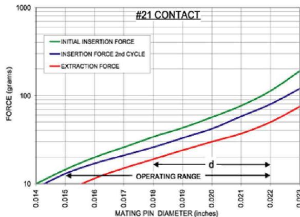
The insertion/extraction/normal force characteristics above were derived using a 30 microinch gold plated contact and polished steel gauge pins having a bullet-shaped tip.

†Since BeCu loses its spring properties over time at high temperatures; it is rated for continuous use up to 150°C. For applications up to 300°C, Mill-Max offers many contacts in Beryllium Nickel. Contact Tech Support for more info.