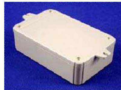
Assembled View Flanged Lid