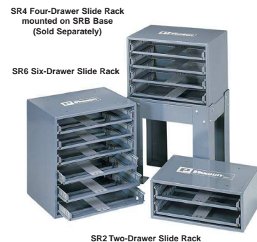
Base and slide racks are sold separately