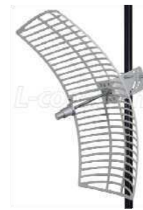
Tilt & Swivel Mast Mount