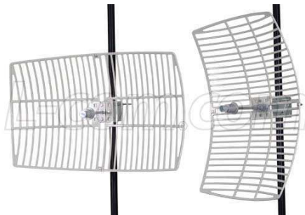
Vertical or Horizontal Polarization

The antennas' construction features a rustproof cast aluminum reflector grid for superior strength and lightweight. The 2-piece reflector grid is simple to assemble and significantly reduces shipping costs. The grid surface is UV powder coated for durability and aesthetics. The open-frame grid design minimizes wind loading. This antenna is supplied with a 60-degree tilt and swivel mast mount kit. This allows installation at various degrees of incline for easy alignment. They can be adjusted up or down from 0° to 60°.