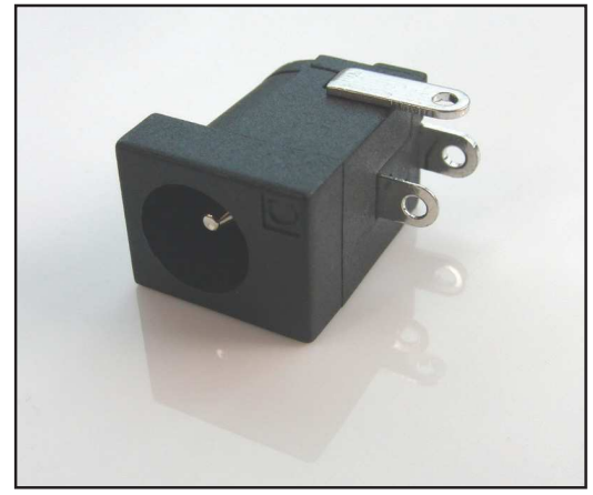
FCR681465 DC10L Solder Tag