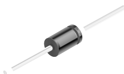
DO-35 Glass case COLOR BAND DENOTES CATHODE