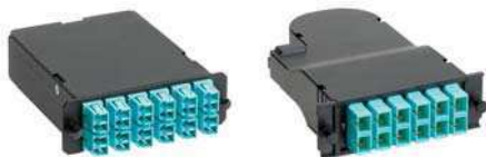
FC^ - 24-10Y