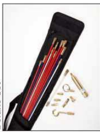
Includes a light weight carry bag with shoulder strap

Article Number: 897-90001 Type: CS-SD Description: The most comprehensive set for carrying out larger installations Content Rods: 2 x 4mm x 1000mm (white) 6 x 5mm x 1000mm (red) 2 x 6mm x 1000mm (blue) Rod Capacity (m): 10 Content: Attachments: 150mm white flexi lead, split ring, gender changer, tuff hook, mini eye, domed bullet, flat bullet, beam, single magnet.