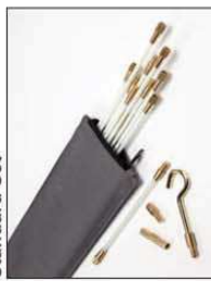
Includes a light weight easy access carry bag

Article Number: 897-90000 Type: CS-SB Description: Designed to perform standard cable installation Content Rods: 10 x 4mm x 1000mm (white) Rod Capacity (m): 10 Content: 150mm white flexi lead, gender changer, tuff hook, mini eye.