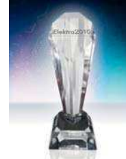
Elektra Award 2010