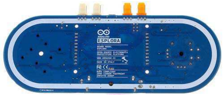
Arduino Esplora Rear