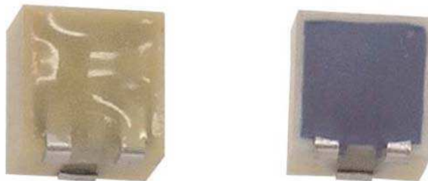
Tan Epoxy Compared to Traditional Blue Epoxy

New samples and test data are available upon request. We will be releasing additional models with the tan epoxy and notice will be made prior to their release.